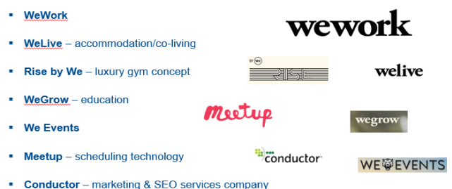
Figure 3: WeWork offers more than office space

→ At present the reality is WeWork is a property management company with strong branding