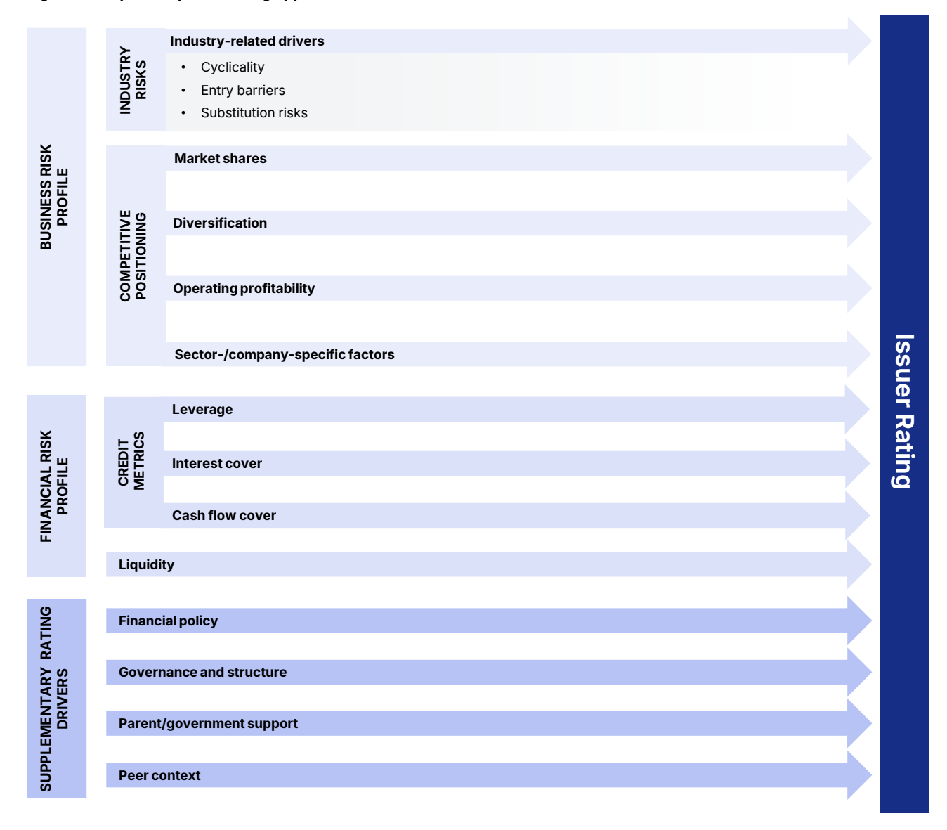
Figure 1: Scope's corporate rating approach